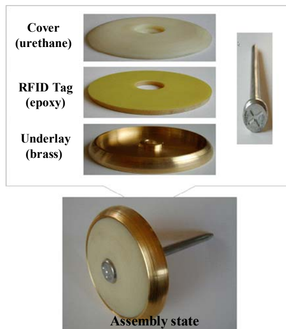
Fig. 7 Self-manufactured RFID marker

Manufactured RFID maker is largely composed of three sections: projection cover, tag-cover and underlay. Taking form the existing control point maker and Electric Wave Signal was Often Made to be Penetrated,