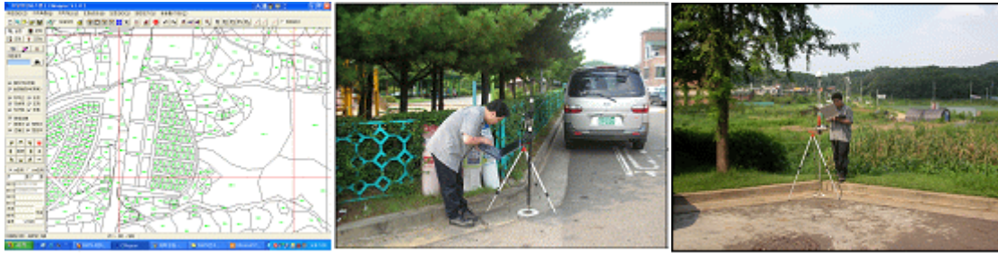
Fig. 6 region of city experiment