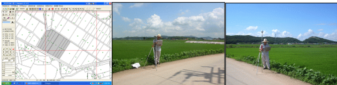
Fig. 5 land consolidation experiment

Because this experiment had not had a precedence research example in the country, It experimented after examining beforehand the case where this experiment can generate procedure and the method. An arrangement area (Fig. 5) and region of the city (Fig. 6) it experimented. The base map is 1/1,000 numerical-value indication.