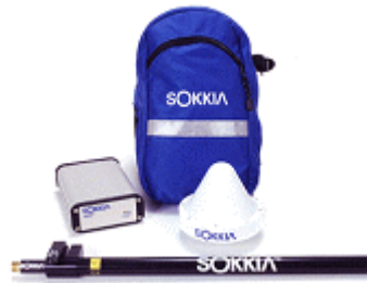
Fig 2 Beacon DGPS One apparatus receiver Axis 3(Sokkia Co.)

Beacon DGPS Experiment equipment was used with one apparatus receiver Sokkia's DGPS. Because Axis3 unified with one set of a receiver and an antenna by 12 channels, Beacon with L1 GPS receiver and the satellite signal, there was no need the special cable used with the existing product. it can use.