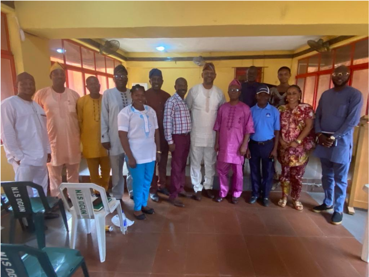
Group photograph of the participants