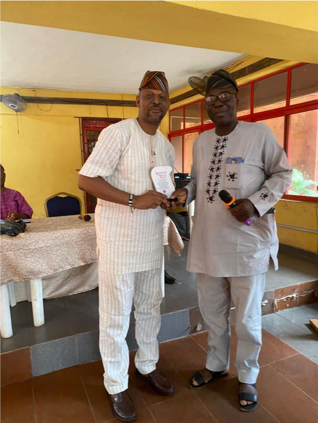
Plaque award to the 1st Speaker- Nigerian Institution of Surveyors Vice President International