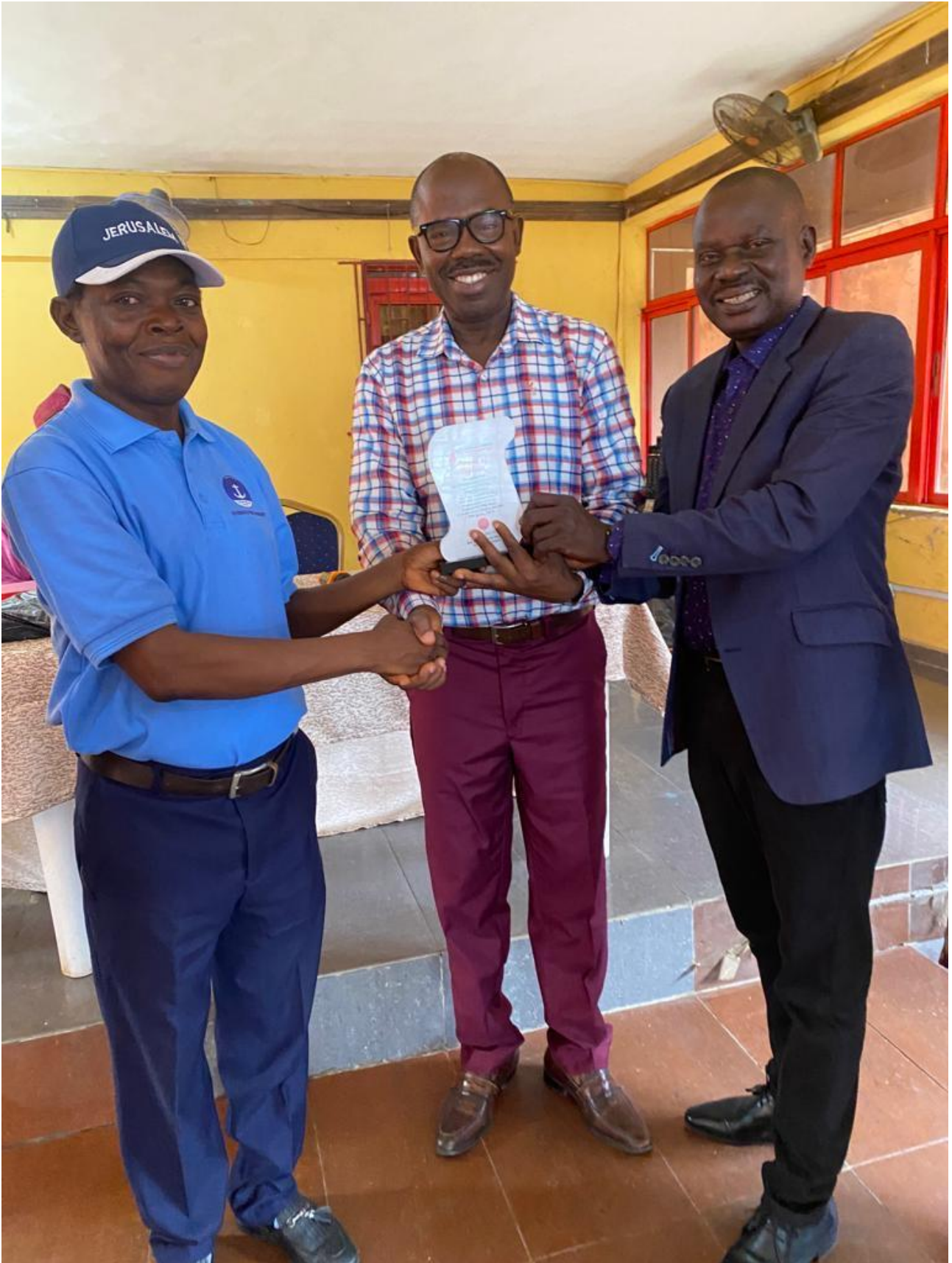
Plaque award to the Hosting State (Nigerian Institution of Surveyors, Ogun State Branch)