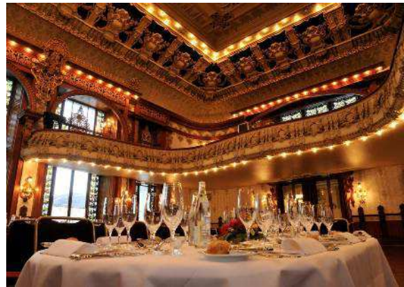
FIG Working Week 2020