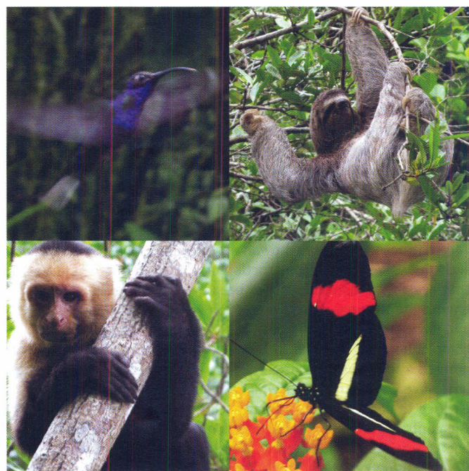
Some of Costa Rica's wildlife. Clockwise from top left; humming bird, sloth, Heliconius Erato (also commonly known as 'the postman' butterfly because it always returns to the same plants or flowers at the same time each day) and a white faced monkey.