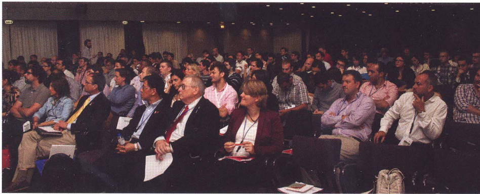
Knowledge transfer. Delegates absorbing one of the presentations at the conference.