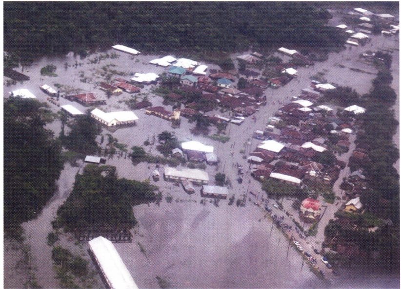
Devastating flooding at Ahoada, Rivers State, Nigeria during October 2012.

Nigeria was affected by widespread and unprecedented flooding in September and October 2012. Shell Petroleum Development Company (SPDC) is the major oil and gas operator in the Niger Delta and their