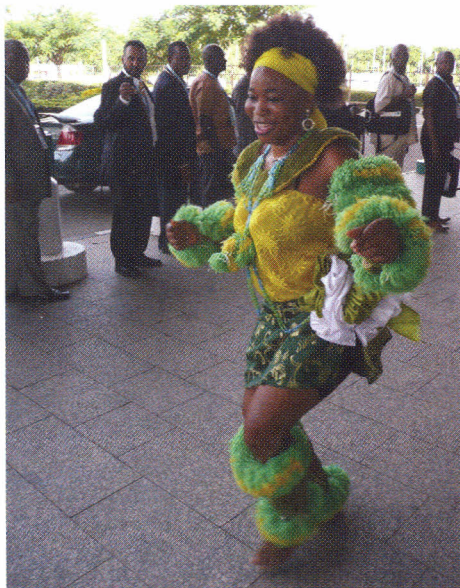
Below: queuing delegates are entertained by a dancer ahead of taking a partner to learn the delegate two-step. . .

The Opening Ceremony on Tuesday saw a full auditorium at the Convention Centre hear the Minister for Lands Mike Onolememen , an architect, extend a warm welcome on behalf of Nigerian President Goodluck Jonathan , who was detained on overseas business. Mr Onolememen has a great connection with the surveyors of Nigeria and his speech displayed a true affection and appreciation of the value of the work carried out by our profession in his country.