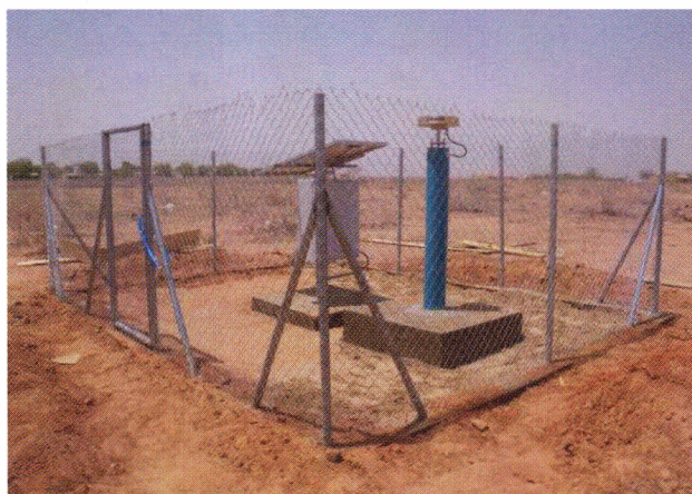
Remote CORS installation in Nigeria (By kind permission of SEGAL (Space & Earth Geodetic Analysis Laboratory).

Elujobade (TS05C) describes CadastralUltra, a purpose-built low-cost GPS system for cadastral survey in Nigeria. He says that land surveyors in Nigeria have resorted to using navigation grade devices for cadastral survey because the cost of survey-grade instruments is prohibitive. CadastralUltra consists of a handheld L1 receiver that can record carrier phase data and an external antenna. The equipment is used to observe static baselines, which are post-processed. This may help with relative measurements but it still needs a precisely known point in order to obtain