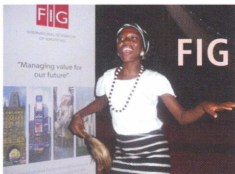
FIG Abuja surpasses expectations - working week has over 2700 delegates

With dancing, bands and colourful traditional local dress John Brock reports for GW on a memorable conference in Nigeria's capital city