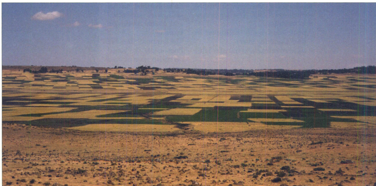
Landscape of Amhara Region.

aid would increase if nothing were done to reverse the situation. Security of tenure would enable farmers to invest for the long term, which would in turn support food security, economic development and contribute to the protection of the environ-