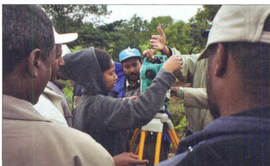
On-the-job training in surveying.