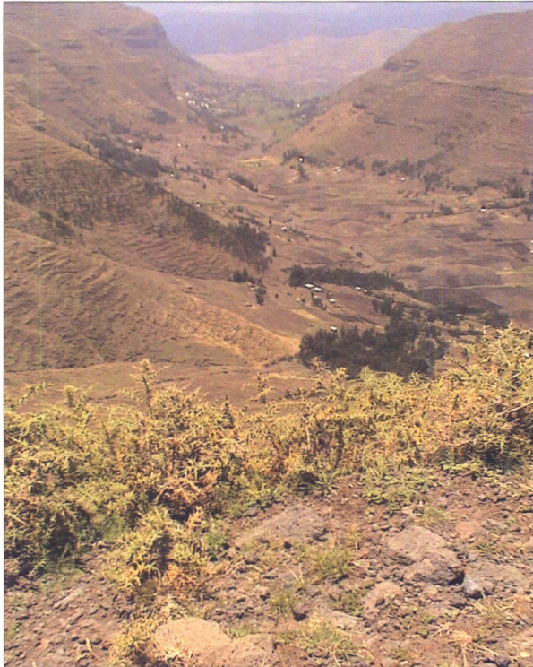
Drought in the region.

ment. Considering the importance of security of tenure, the Amhara Region decided that all farmers would have long-term rights to land based on legislation.