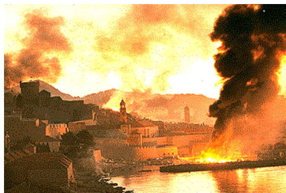
Figure 3: Shelling of Dubrovnik.

In the four years of the conflicts, over 11,000 persons were killed, over 37,000 were wounded, about three quarter million people fled their homes and the material damage inflicted is estimated at 30 billion US$. Following that, from the neighbouring Bosnia and Herzegovina, which was involved in an even fiercer and cruel war, another quarter of a million people escaped to Croatia. Although these figures clearly quantify the losses and damages inflicted by the war, they do not describe the suffering and the long-term losses of all the people affected by the war. It was only at the end of 2003 that the Republic of Croatia reached the GNP it had in 1990!