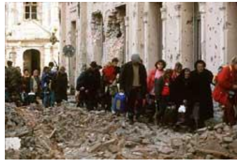
Figure 2: Destruction of Vukovar and the exile of the population after the fall of the town.