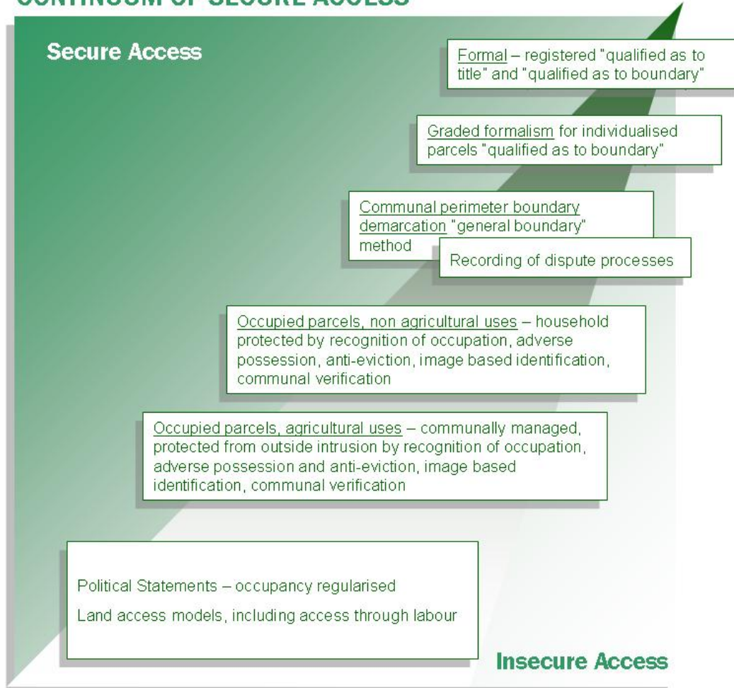
Figure 2, Scaling up occupation of rural poor in APR