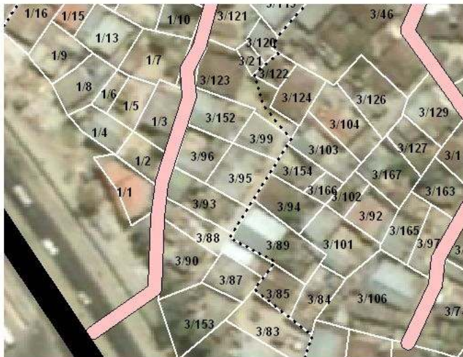
Figure 2: A photo-map composite.

Back in office, the boundary lines are screen-digitized on the original soft copy imagery, landholding sizes determined and numbers entered to get a photo-map composite showing digitized boundaries, landholding numbers, buildings as well as other topographic features appearing on the imagery (Figure 2).