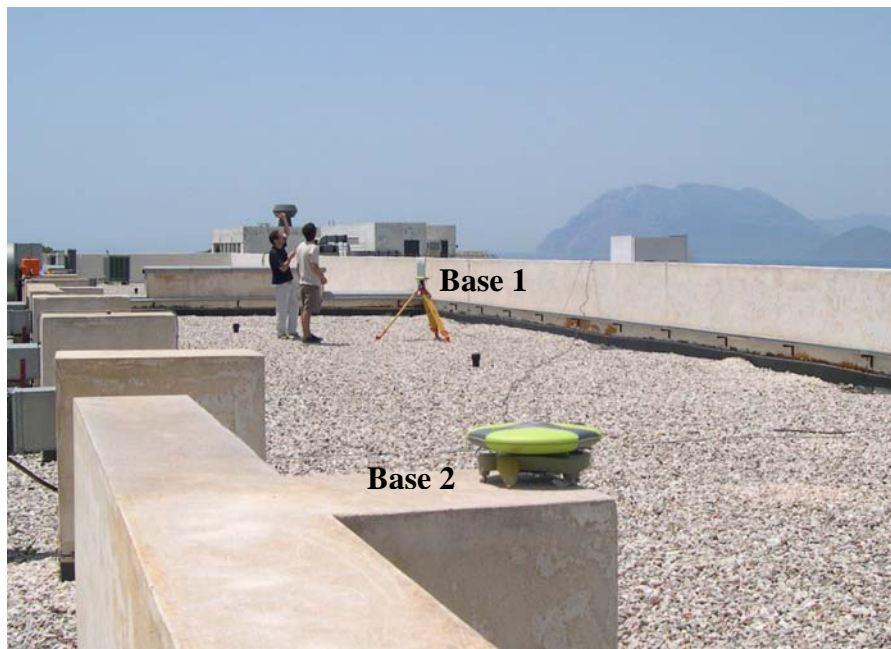
Figure 1 The two GPS stations during the experiment

antenna (JAVAD JPSLEGANT-E). The two stations defined a short baseline (length about 20 m). Data were sampled every 30 seconds for 6 full days (16-21/06/2003). An elevation mask angle of 15^\circ was used. The bases of the two GPS stations were fixed on stable ground free of surfaces which would induce multipath error or reduce the satellite availability.