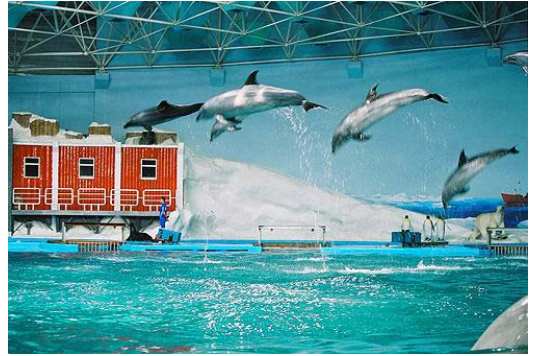
Qingdao Polar Sea World