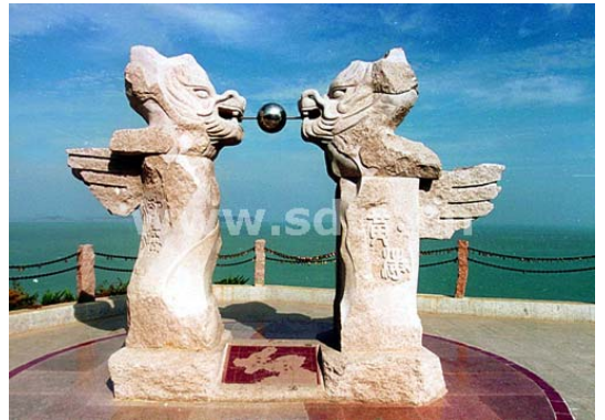
Boundary Coordinates of Yellow Sea and Bohai Sea