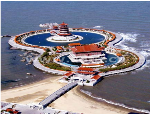
Weihai: aerial photography of Eight Immortals crossing