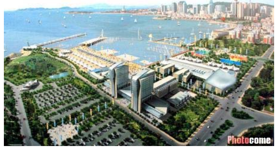
Qingdao Olympic Sailing Center

And the consequential impact this has on the City authority attempts to integrate policy and management along the coast to reverse the environmental decline.