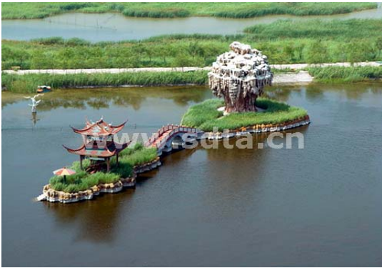
Dongying: Swan Lake Scenic Spot-Stalactite