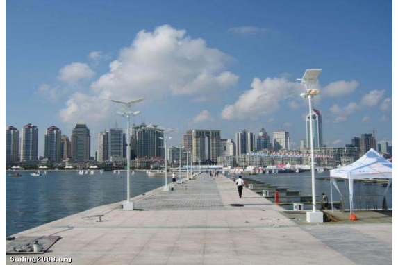
Less Deep Breakwater