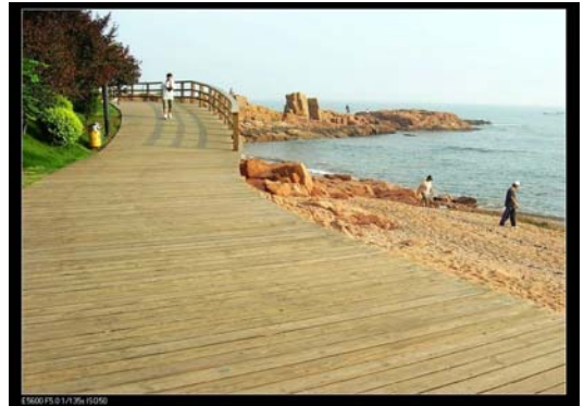
Qingdao coastal Walking path