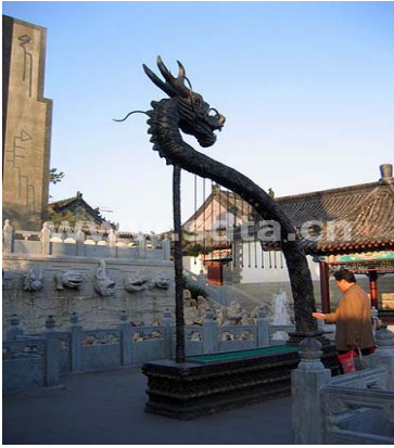
Weihai: Lingong Island Museum - bronze water Guoqin