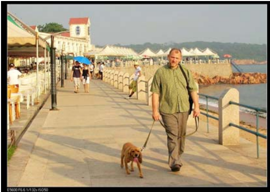
Qingdao coastal Walking path