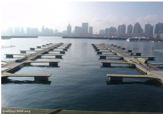
Olympic Sailing Base: Floating Piers