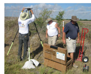
Figure 3. Deflection of the Vertical camera and GPS collected for geoid slopevalidation survey