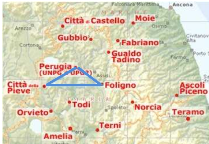
Figure 2 –The tested network

The choice of the typology of stations has not been casual, on the contrary vertexes were chosen to reconstruct a situation very similar to a field survey with point not too much distant among them.