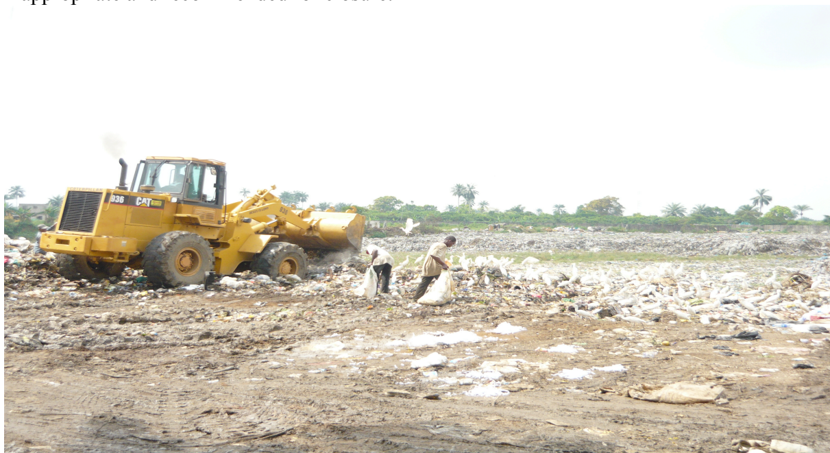
Fig 4.4—Doza and Scavengers at work at the Eliozu Dumpsite, Port Harcourt.

to haulage. Temporary dumpsites located within built-up areas are also considered inappropriate and recommended for closure.