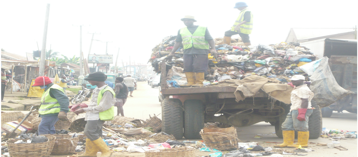
Plate 3—Waste Evacuation along Ada George Road, by Okilton Bus-stop, Port Harcourt.