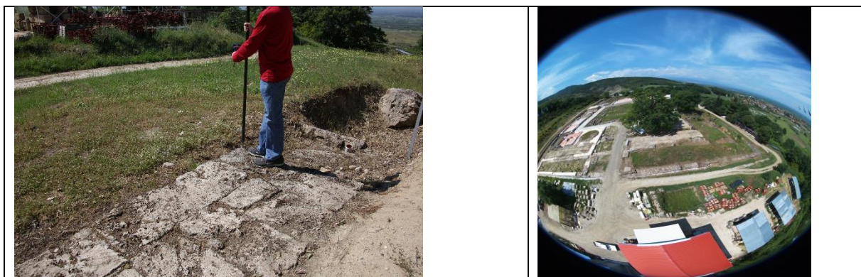
Figure 5: Archeological site in Vergina (Greece): Aquireing GCP's (left) example image of the 180 degree fisheye image from the bebop2 flight.

We mapped the archeological site in Vergina (Greece), the Palace of Philip II, with four different consumer drones. The data has been captured and processed in May 2016 with the