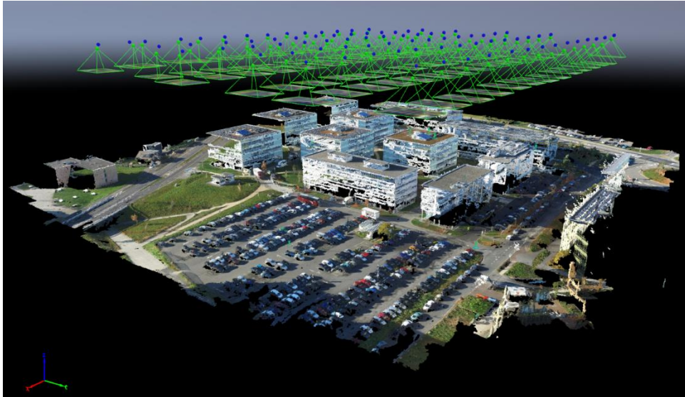
Figure 1: Screenshot of the Pix4Dmapper reconstruction of our test site for a dataset recorded with a DJI Inspire 1.