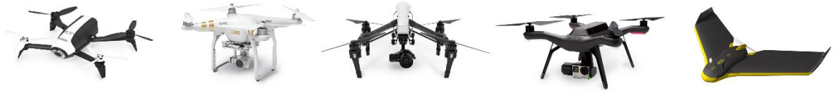
Figure 2: Evaluated drones from left to right: Parrot Bebop2, DJI Phantom, DJI Inspire, 3DR Solo with GoPro HERO4 and senseFly eBee (used as reference for a professional drone).

In the following sections, we show that for mapping applications with small unmanned aerial vehicles (UAVs) using a controlled flight plan (see Fig. 3), a rolling shutter model describing the drone translation velocity during the exposure of each frame is sufficient to compensate for the motion-induced rolling shutter artifacts and preserve mapping accuracy even at high speed. To this purpose we will evaluate the accuracy of reconstruction using a set of consumer UAVs (as shown in Fig. 2) for the acquisition of images which are processed with and without a rolling shutter model.