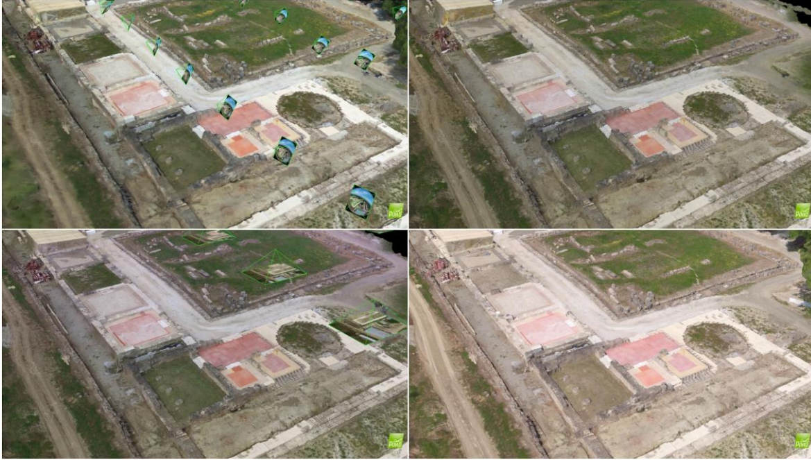
Figure 7: Another view of the rendering similar to Figure 6: Rendering of the textured triangle mesh (top-left Bebob2; top-right Phantom3; bottom-left Inspire1 x3; bottom-right Inspire1 x5). Here we see an interesting feature of the Bebob2: due to the fisheye camera, even the area underneath the tree is reasonably well reconstructed. The Phantom3 and Inspire1 X3 did not reconstruct the tree in this particular case. Due to its lower resolution the Bebob2 model looks a bit more blurry. The Inspire1 x5 has a sharp texture and triangle mesh. Figure 6