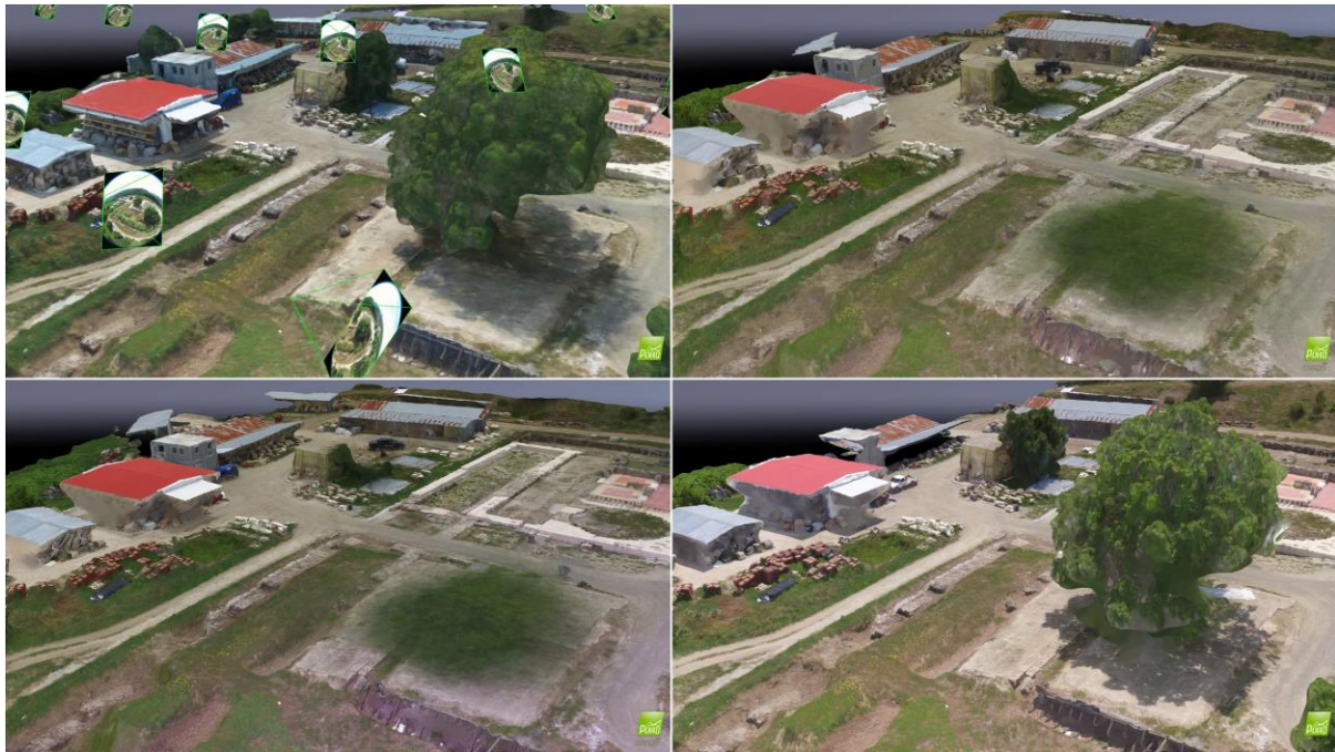
Figure 6: Rendering of the textured triangle mesh (top-left Bebop2; top-right Phantom3; bottom-left Inspire1 x3; bottom-right Inspire1 x5). Here we see an interesting feature of the Bebop2: due to the fisheye camera, even the area underneath the tree is reasonably well reconstructed. The Phantom3 and Inspire1 X3 did not reconstruct the tree in this particular case. Due to its lower resolution the Bebop2 model looks a bit more blurry. The Inspire1 x5 has a sharp texture and triangle mesh.

The adaption of drones in archeological applications is influenced by the above accuracy