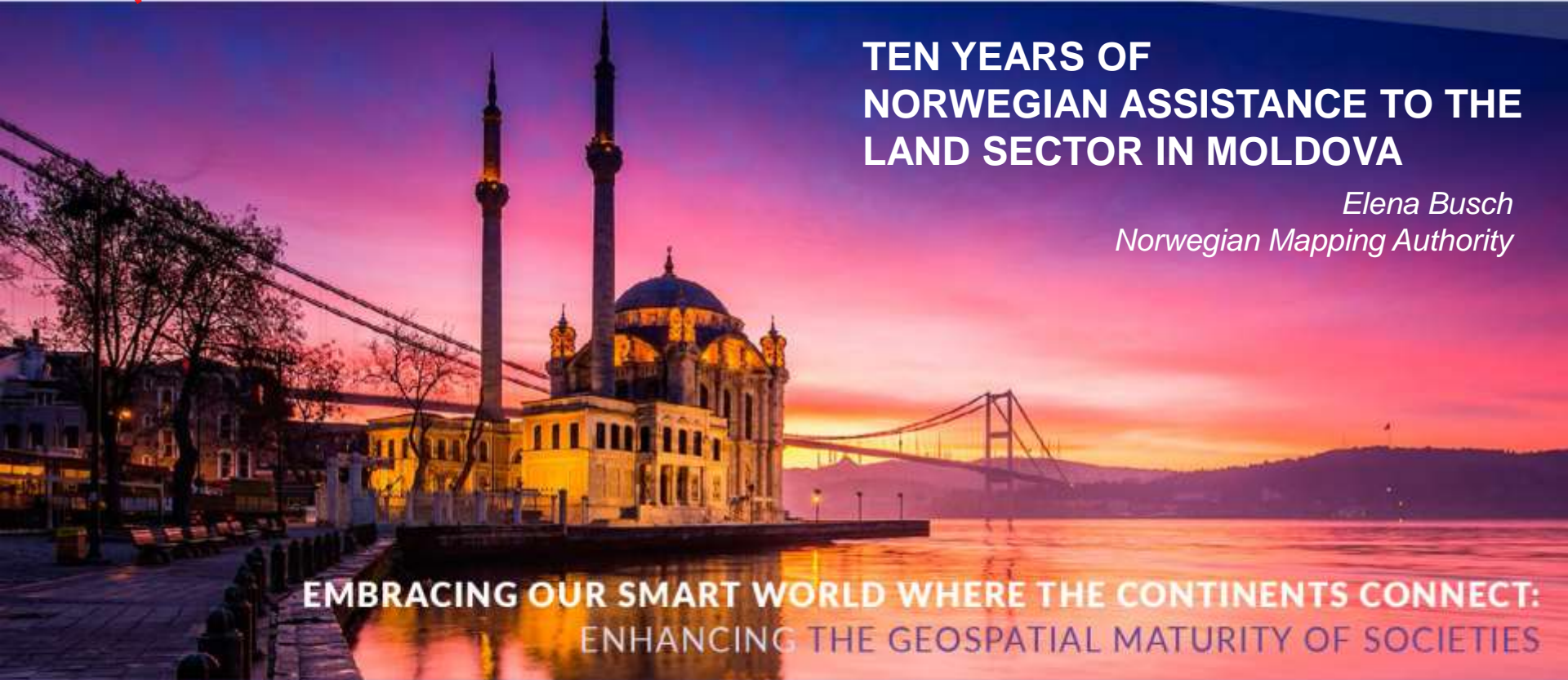
FIG Congress 2018