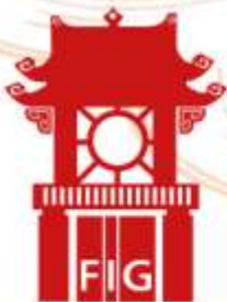
FIG WORKING WEEK 2019