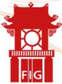
FIG WORKING WEEK 2019