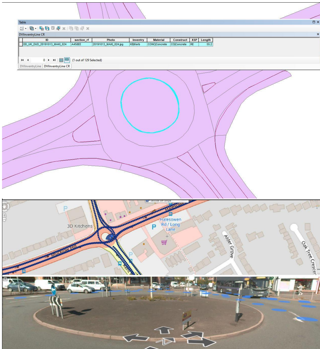
Figure 3: Line inventory- Kerb with its attributes, picture and position in 3DM Publisher