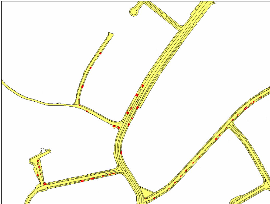
Figure 4: An overview of defects for one project part

The final product is shp file consisting of polygons, lines and points that refer to defects (Figure 4).