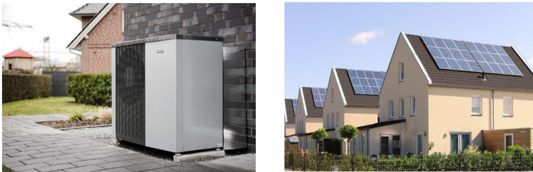
Figure 3: Energy transition: heat pump (left) and solar panels (right) might lead to new forms of modular financing.

For individual properties this requires a large investment. A mortgage linked to the property could be a logical way of financing these facilities in a modular way (existing in parallel to an existing mortgage). When the house is sold that has the consequence the mortgage is transferred as part of the property. At the moment we are looking how this modular way of financing can be accommodated in land transactions and thereby in the cadastre and land registry.