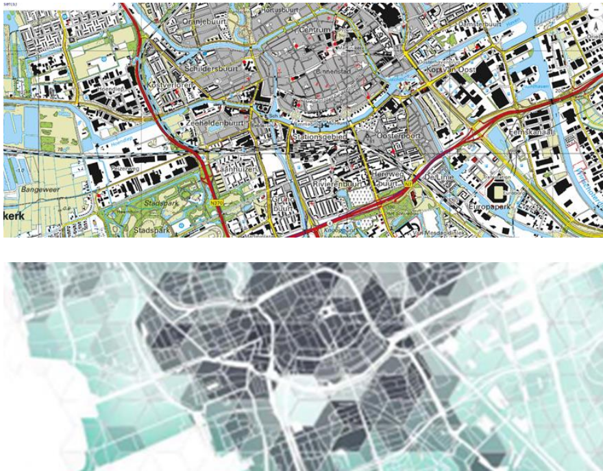
Figure 4: Visualisation of the density of paved areas (grey) and green areas (green) City of Groningen as basis for policy making on conversion measures (source: Jeroen Drewes; winner of the 2019 GIN-Cartography Contest).