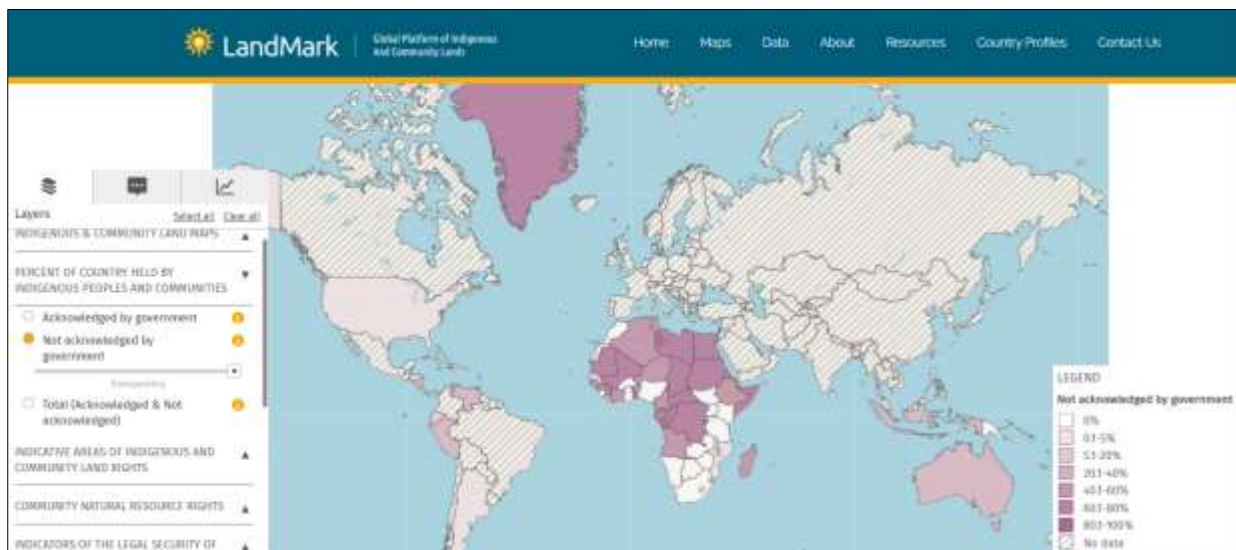
Figure 1. More than half of the lands held or used are still not acknowledged by the government in many countries worldwide. Data from (Dubertret and Alden Wily, 2017). Map from http://www.landmarkmap.org/ .

Land has a central role to livelihood, identity and power. The documentation of land rights is an essential step to make progress towards a more peaceful and sustainable future of our planet and for achieving the SDGs, with Goal 1 “No Poverty” (Indicator 1.4.2: proportion of total adult population with secure tenure rights to land) in particular. In most cases, the land of indigenous people is governed by customary law and informal arrangements ruling community allocation, access, use and transfer of land and natural resources. In contrast to statutory tenure, customary tenure is usually not fully protected by the state. Millions of those customary land rights are still undocumented. Evidence presented in Figure 1 shows that in some countries, more than half of the lands held or used by indigenous communities are still not acknowledged by the government.