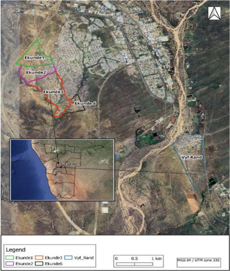
Figure 1: The selected informal settlements in Okahandja

Land Information in Informal Settlement Upgrading: the Social Tenure Domain Model as an Empowerment Tool in Okahandja, Namibia (12634) Cathrine Marenga, Tapiwa Maruza (Namibia), John Gitau, Paul Gathogo (Kenya) and Jennilee Kohima (Namibia)