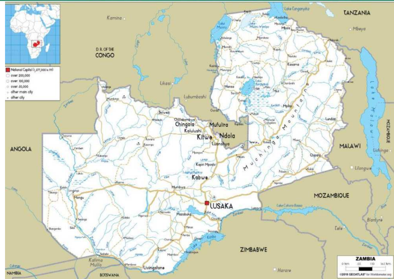
Map of Zambia