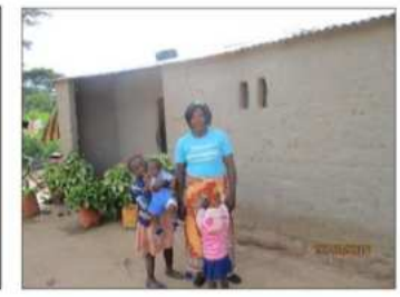
The persons listed below are the bonafide occupants of parcel number: CHS 001 A highlighted in the map above.